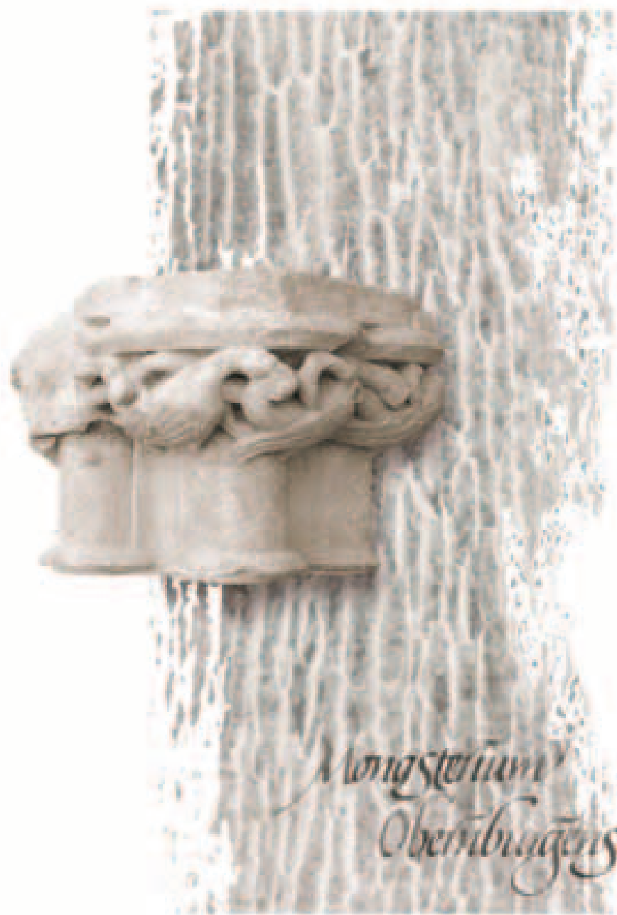
Fragment XII, GORNO GRAD